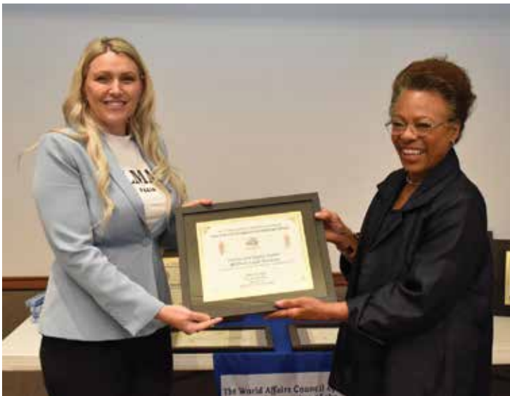
MidPenn Legal Services' Justice & Equity Center was honored with a Torch Award by the World Affairs Council of Harrisburg on May 22nd.