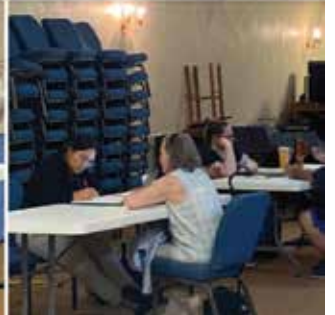
MidPenn Legal Services was proud to be part of the Expungement and Pardon Clinic held in May of 2024. We worked with the Pardon Project of York County along with The Program "It's About Change", the York County (PA) Bar Association/York County Bar Foundation and the York County Clerk of Courts to help 50 individuals seeking a fresh start.